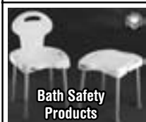
Bath Safety Products