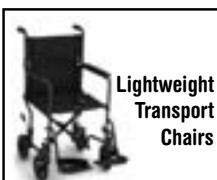
Lightweight Transport Chairs